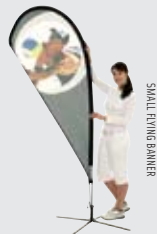
SMALL FLYING BANNER